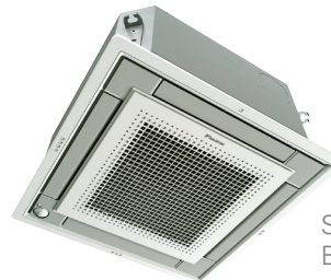
Shown with panel BYFQ60C2W1S