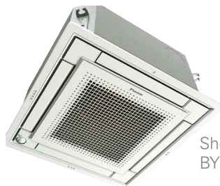
Shown with panel BYFQ60C2W1W